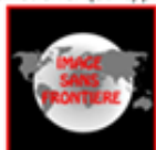
IMAGE SANS FRONTIERE IMAGE WITHOUT FRONTIER pour la promotion de l'image photographique de qualité for the promotion of quality photography